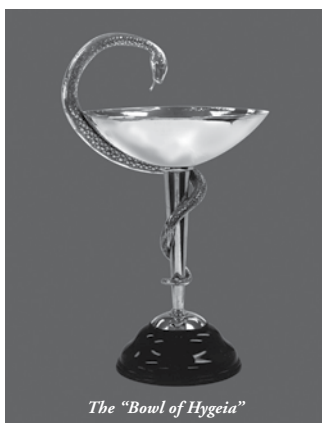
The “Bowl of Hygeia”