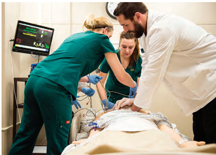
More than 130 NDSU pharmacy and nursing students each semester participate in interdisciplinary training which includes sessions such as code experience in the Simulation Lab in Sudro Hall. Students gain expertise in fast-paced team environments to prepare them for future careers in health professions.