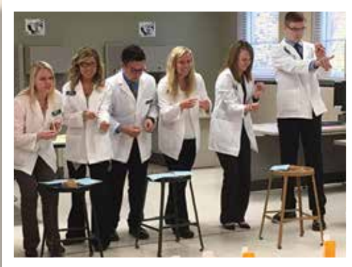
This is how to celebrate National Pharmacy Week from Oct. 16-22! It's the NDSU School of Pharmacy version of a "Minute to Win It" game show. Students answered pharmacy questions for their teams to advance. Vitamins, drug interactions, and many more questions were posed to see if students quickly remembered the knowledge learned in hours of classes.

On social media, some students shared their reasons for studying pharmacy and why they chose NDSU.